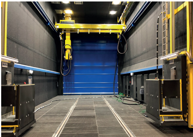
SLF blastroom with blast media robot ReCo-Blaster®, crane bridge-guided in rotating device.

Quality, stability and safety are particularly important in the heavy-duty sector. It is therefore a great advantage if you only have one reliable contact partner for the entire system technique. At SLF you get everything from a single source! Whether pre-treatment, blasting, painting or conveying – at our location in Emsdetten (Germany), all components are precisely coordinated to meet the highest demands in your production process. Our experienced employees also personally carry out the assembly and service at our customers' sites.